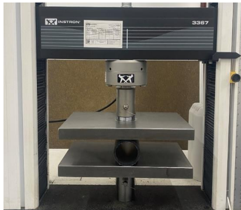
Figure 1 Resistance to deformation test rig

Test Equipment Instron 3367 , 15mm +/-0.5 per minute crosshead speed (Figure 1).