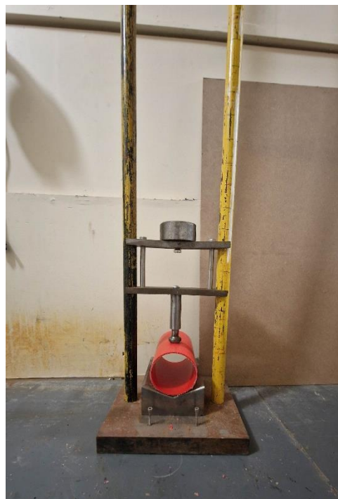
Figure 2 Impact test rig

Test Equipment Temperature controlled environmental chamber, as shown in Figure 2