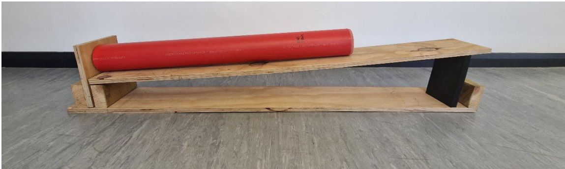
Figure 3 Static friction coefficient test rig