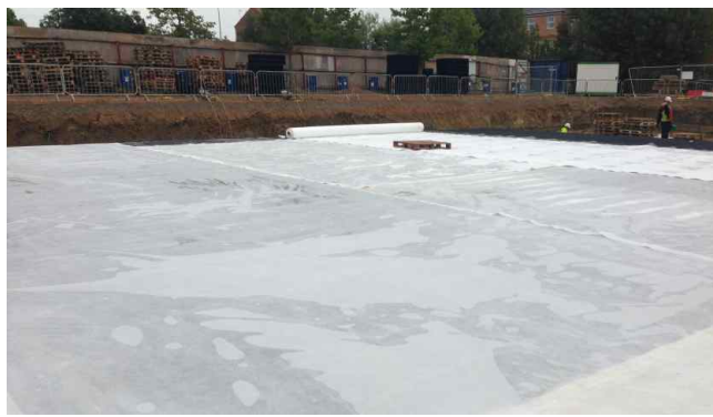
Photo shows a multi layer soakaway being installed with geotextile surround. This large soakaway has high level entry points, inspection routes to ensure no silt build up and is positioned beneath a very large car park.