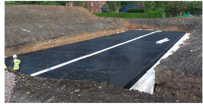
Photo is taken during a multi layer installation with a central porous pipe distribution pipe positioned within the bottom layer. Surface water is fed through the system to a Vortex Flow Control at the exit which when operational backs up the flow to fill the attenuation structure. Hydrocarbon removal is through Naylor Smart Filters.