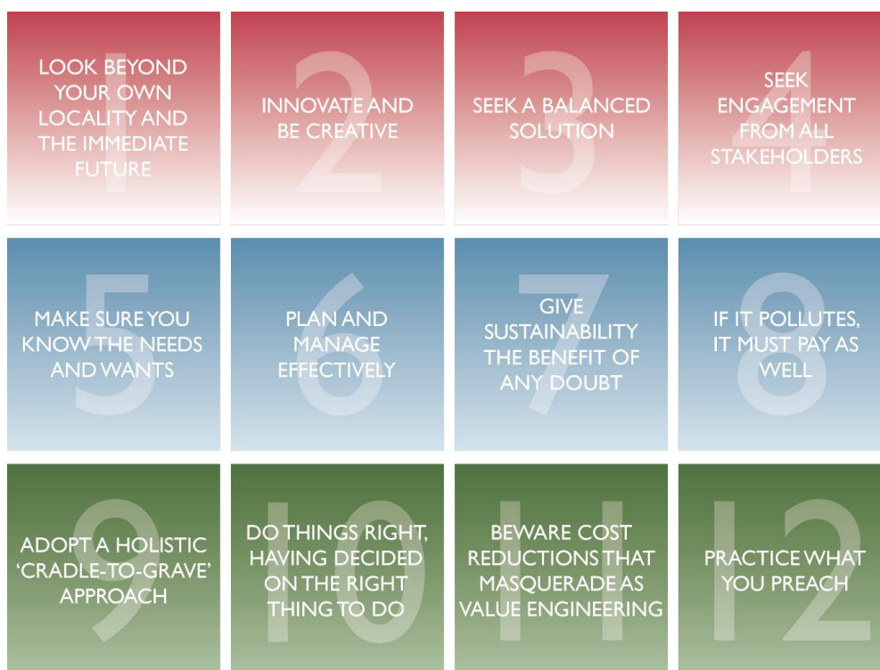
Figure 1.3 – Engineering for Sustainable Development '12 principles'